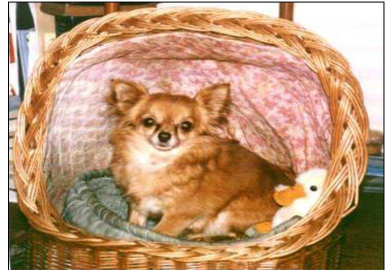
MY PRECIOUS OPAL